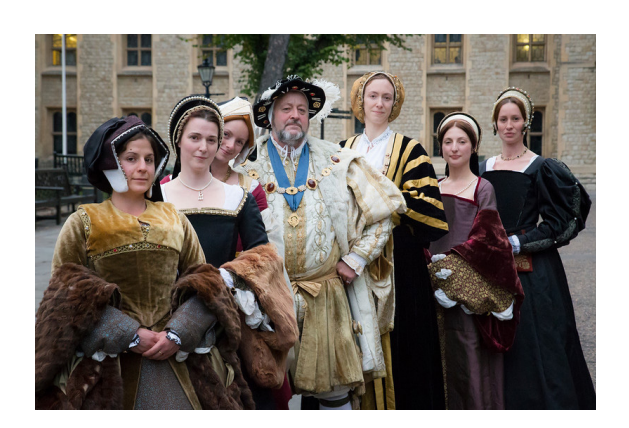
Our costumed hosts at the Tower of London.